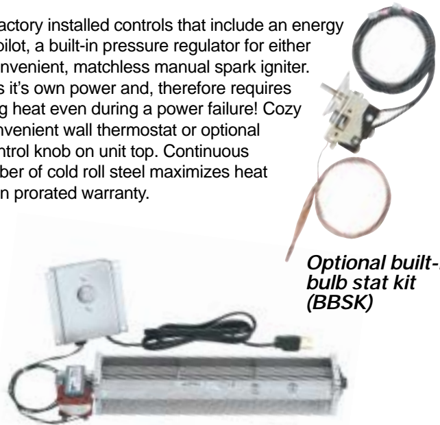
Optional built-in bulb stat kit (BBSK)

Installation Template is packed in each carton to allow convenient location of screw holes, vent opening and gas inlet.