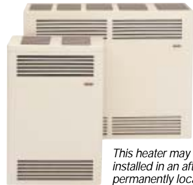
This heater may be installed in an aftermarket permanently located, manufactured home, where not prohibited by local codes.

(DVB-2) installs in minutes inside the cabinet and is prewired to simplify installation. Requires 115 VAC. 81 CFM.