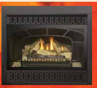
LOGC5 Log Set – Four Piece – Oak

Unit illustrated is a ZDV6000LP Zero Clearance Direct Vent Fireplace – Propane, with LOGFS Log Set, Z6GCR Grill Kit – Chrome, and Z33ADTH Arch Door Top Half.