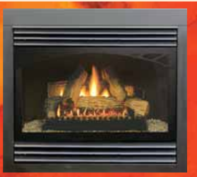
LOGFS Log set – Four Piece – Oak

LOGC5 Log Set shown on the front of brochure.