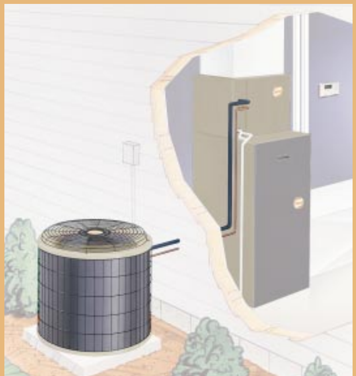
Gas Furnace, Central Air Conditioner and Evaporator Coil System

An energy-efficient Payne furnace provides welcome warmth during winter's blustery chill. Add a Payne central air conditioner and you can also count on cool relief from summer's heat. By matching these two high-quality indoor comfort machines, you've taken a big step toward total, indoor comfort all year long.