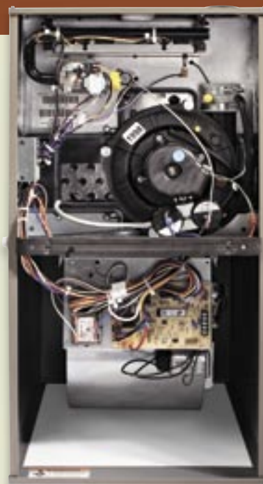
95% AFUE model shown

Electronic hot surface ignition saves fuel costs with increased dependability and reliability