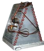
Uncased Vertical A-Coil