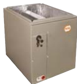
Cased Vertical A-Coil