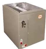
Cased Multi-Poise A-Coil