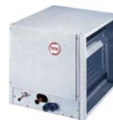
Cased Horizontal N-Coil