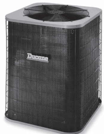
B & BC Models