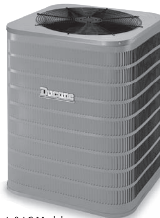
L & LC Models