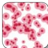
Mold Spores Size (micron) 3-10 Efficiency 99%*