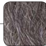
Pet Dander Size (micron) 1-10 Efficiency 98%*