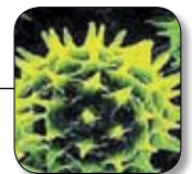
Pollen Size (micron) 5-100 Efficiency 99.5%*

*Efficiency ratings apply to the Echelon™ Premium Hybrid Electronic Air Cleaner 3000.