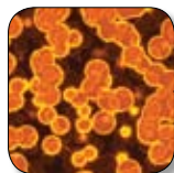
Bacteria Size (micron) .35-10 Efficiency 94%*