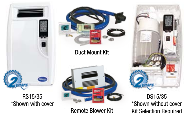
RS15/35 *Shown with cover