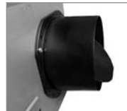
Plastic Backdraft Damper