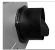
Plastic Backdraft Damper