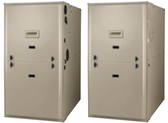
95.5% AFUE Series High-Efficiency Models 80% AFUE Series Mid-Efficiency Models