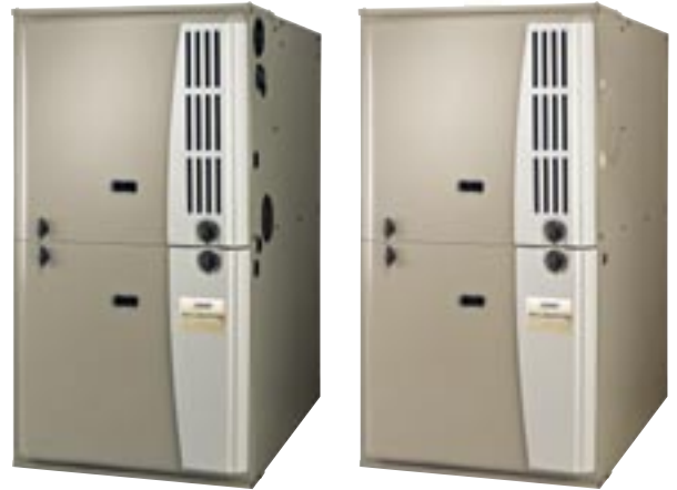
Up to 98% AFUE 9.C and 9.M High-Efficiency Modulating Models