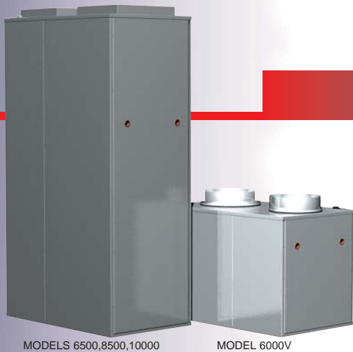
MODELS 6500, 8500, 10000