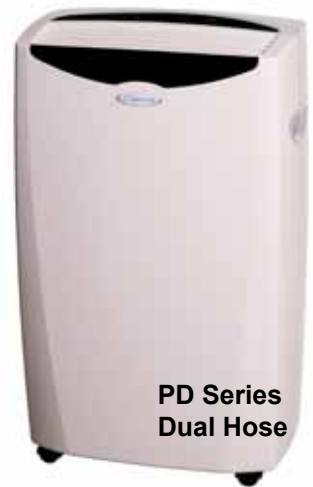
PD Series Dual Hose