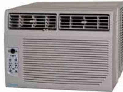
RADS-101G 10,000 BTUH Nominal