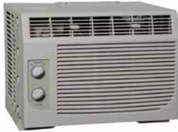
RG-51G 5,000 BTUH