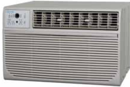
BGE-103G 10,000 BTUH Nominal