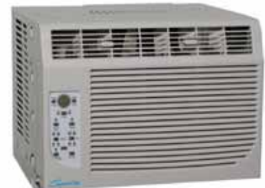
RADS-51G 5,200 BTUH