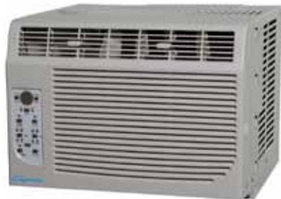
RADS-61G 6,000 BTUH Nominal