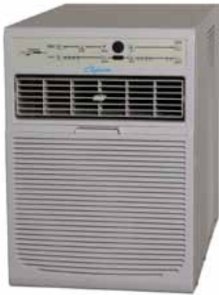
CD-121G 12,000 BTUH Nominal