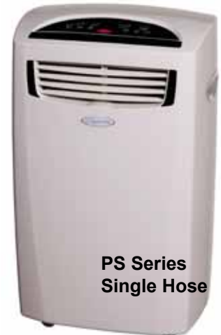
PS Series Single Hose