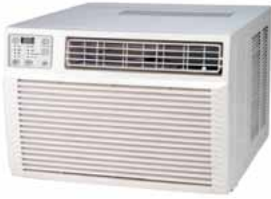
RAH-123G 12,000 BTUH Nominal