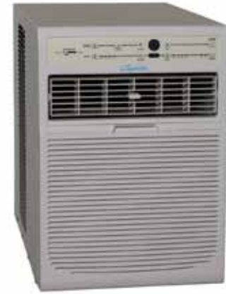
CD-101G 10,000 BTUH Nominal