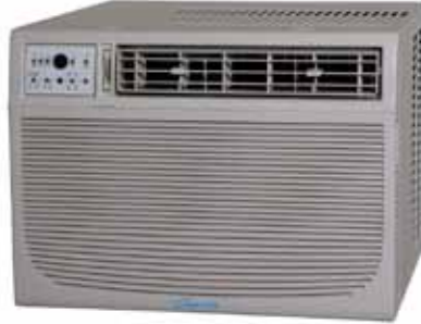
REG-253G 25,000 BTUH Nominal