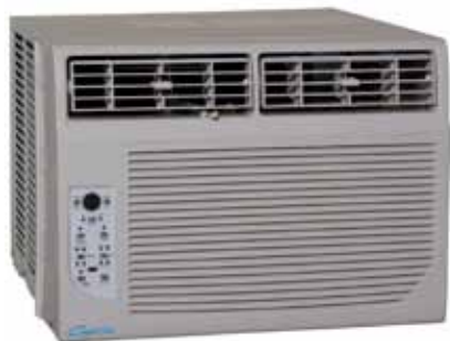
RADS-121G 12,000 BTUH Nominal