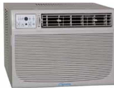
RADS-151G 15,000 BTUH Nominal