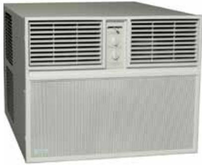
WYB-363-5 36,600 BTUH