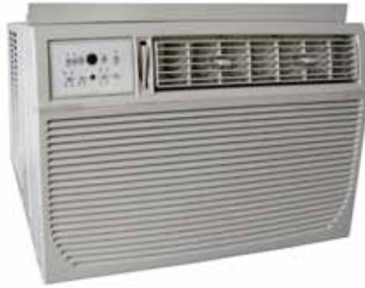
RADS-253G 25,000 BTUH Nominal