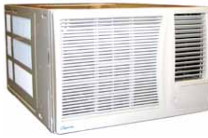
RAH-183G 18,000 BTUH Nominal