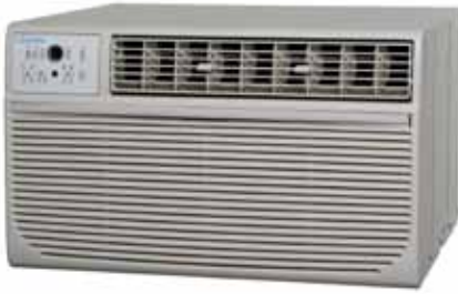
BG-143G 14,000 BTUH Nominal