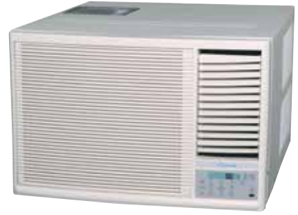
RAD-303A 30,000 BTUH Nominal