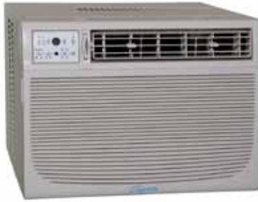
REG-81G 8,000 BTUH Nominal