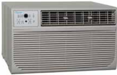
BG-101G 10,000 BTUH Nominal